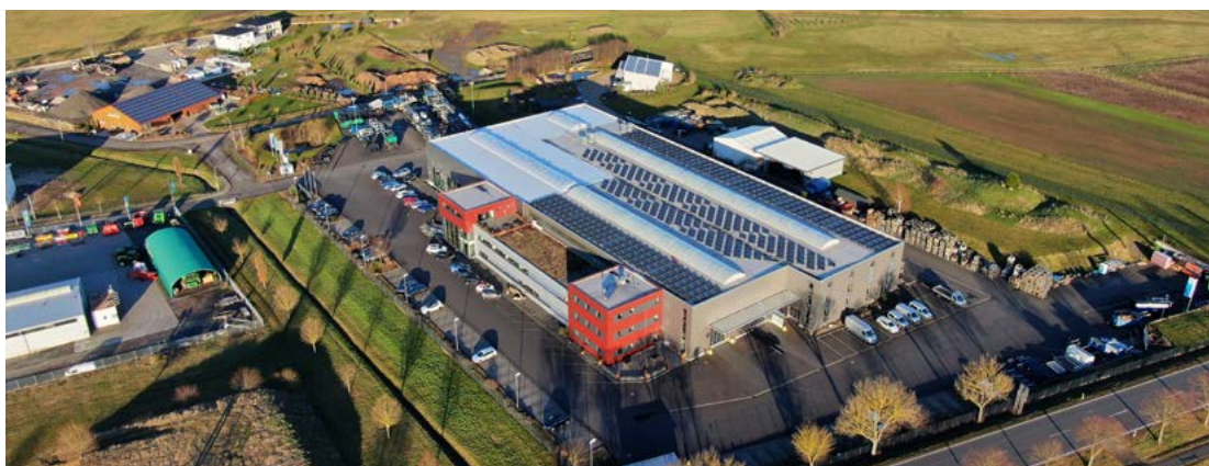
Anlagenbau Günther GmbH

For almost 20 years Anlagenbau Günther and Komptech have had a successful collaboration that has resulted in many innovations in screening and separation technology. It's good reason to extend the collaboration long-term and so drive the growth of star screening worldwide.